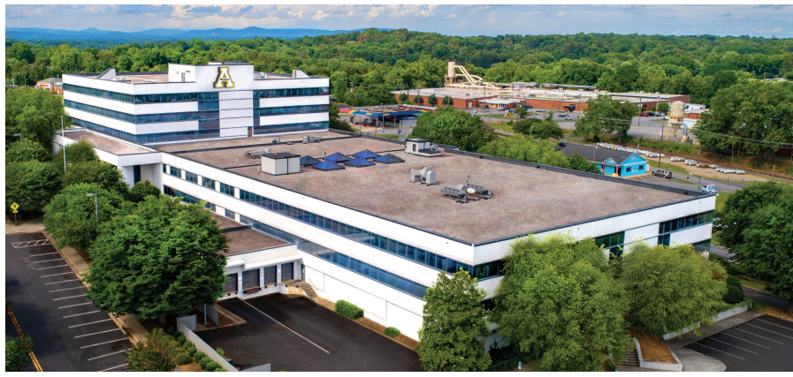
Concept art provides an aerial view of the former Corning Optical Communications building in Hickory. The six-story, 225,800-square-foot facility is the largest in App State's building portfolio.