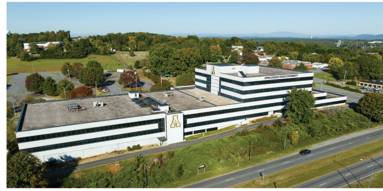
An aerial view of the App State @ Hickory Campus taken October 14, 2022.

In 2021, App State purchased a six-story, 225,800-squarefoot building on 15.7 acres to establish the App State at Hickory Campus, which will begin offering classes in fall 2023. Prior to this purchase, Hickory was the largest metropolitan area in North Carolina that did not have a major, public university campus.