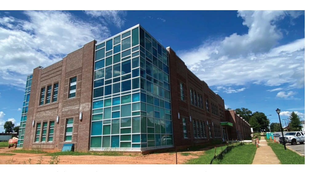
MSC II building located in the center of Conover at Conover Station. It is expected to open in early 2023.

Kathy Blake is a writer from eastern North Carolina.